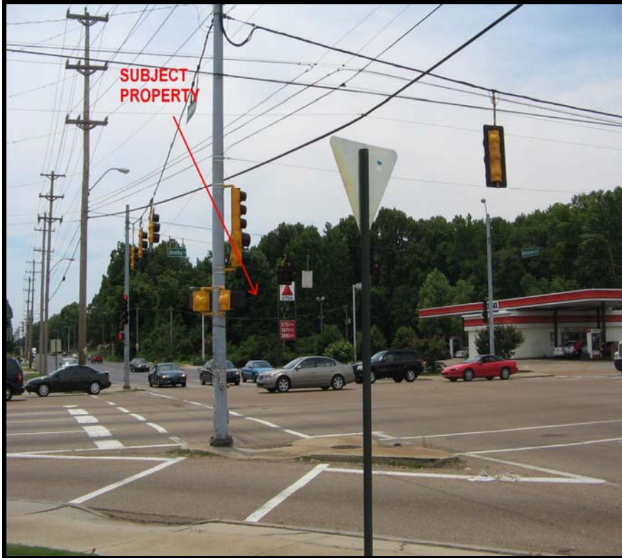
PROPERTY LOOKING SOUTHWEST