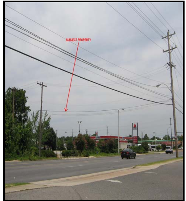
PROPERTY LOOKING NORTHWEST